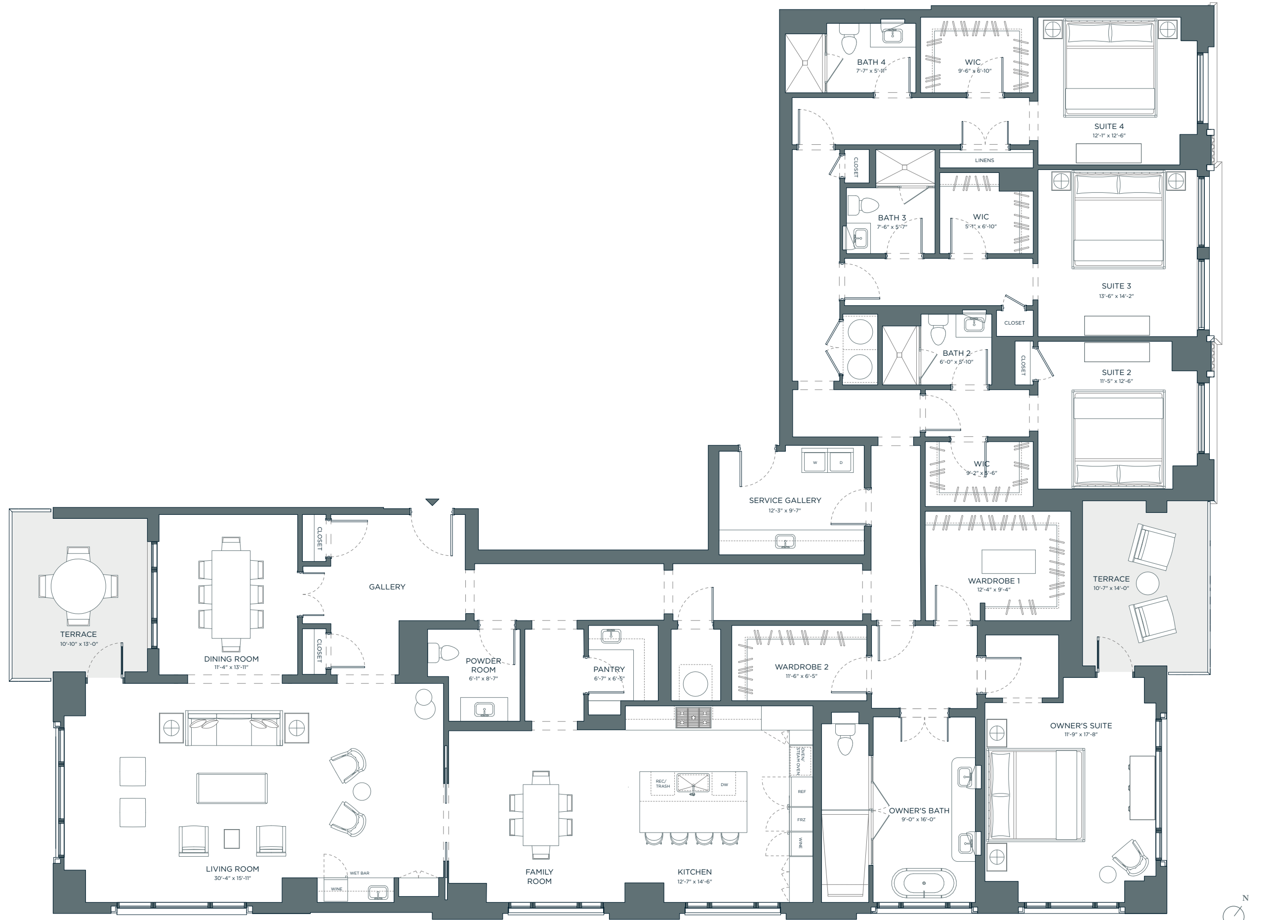
Views to Downtown

Floor plans shown are not to any particular scale and are subject to change. All dimensions are approximate, are subject to change, and are measured using a method substantially similar to ANSI/BOMA Z65.4-2010 Multi-Unit Residential Buildings: Standard Methods of Measurement which dimensions may vary from the description and definition of the "residence" and "unit" as set forth in the purchase contract and which will be conveyed.