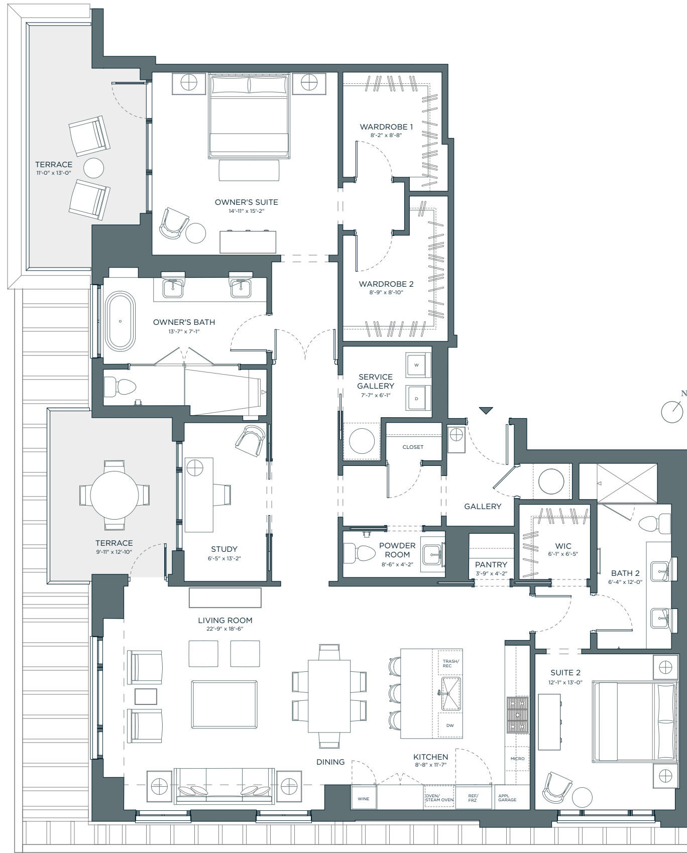
Views to Downtown